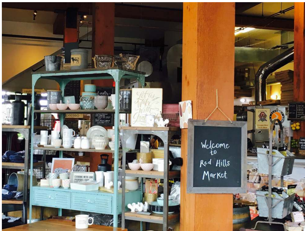
Welcome to Red Hills Market

stay around $10-$15, which feels like robbery. You'll come back for lunch every day.