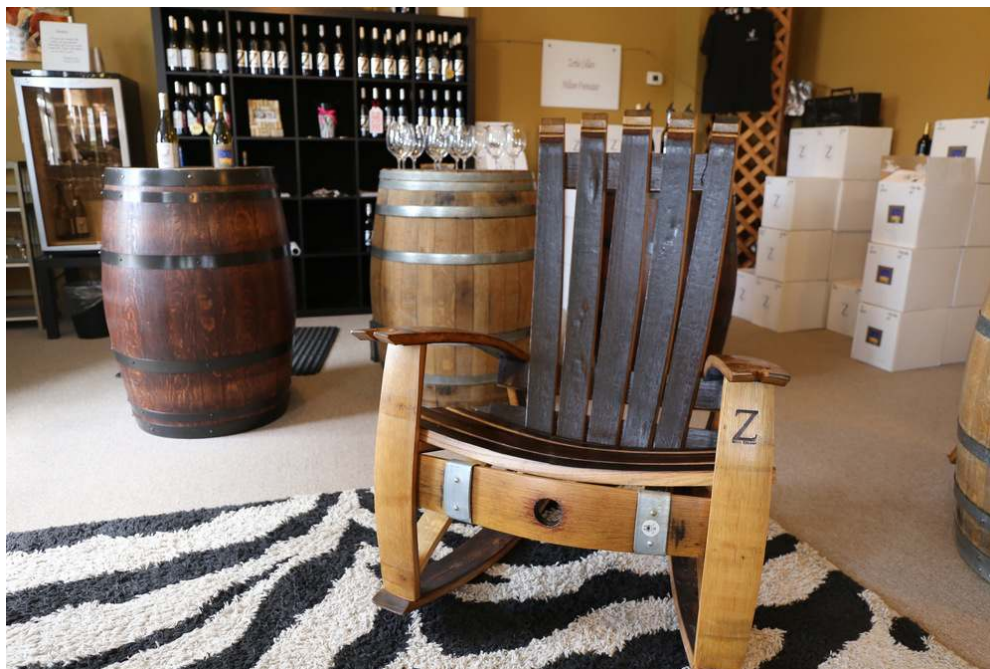
Oak barrel rockers crafted for Zerba Cellars at their Dundee Tasting Room

Domaine Serene , respected as a top-tier Dundee Hills producer, crafts a unique Syrah/Pinot Noir blend worthy of attention.